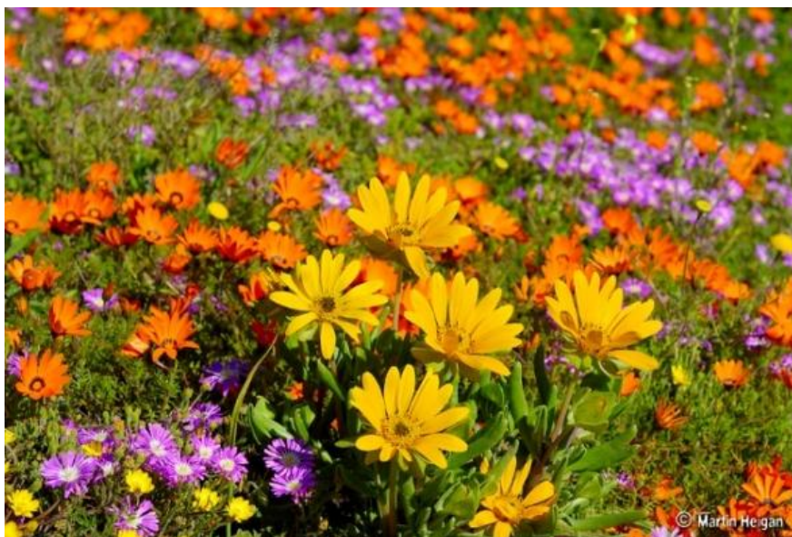
(Namaqualand Wildflower Carpet, M.Heigan, 2007.)