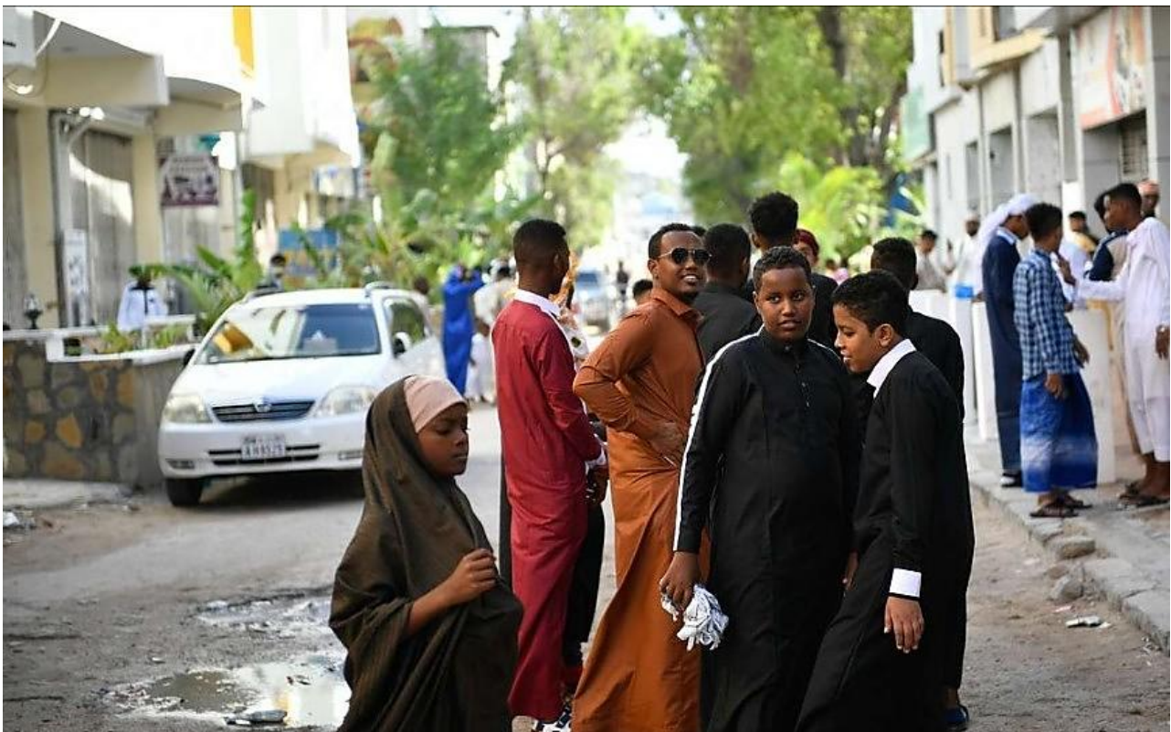
(Mogadishu residents celebrate Eid-al-Fitr, Somalia, 2016.)