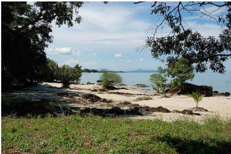
(Lake Malawi, 2007.)