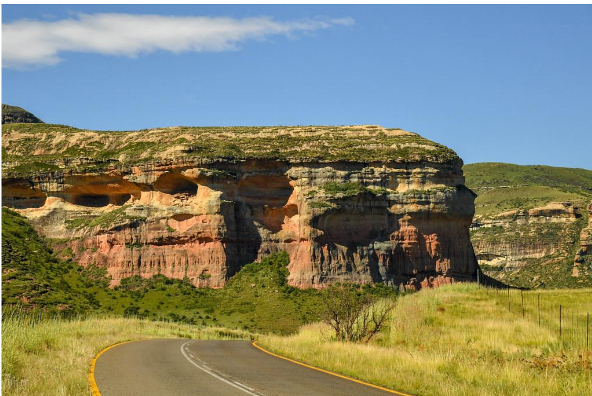
(Golden Gate – South Africa, Ramatsui, 2019.)