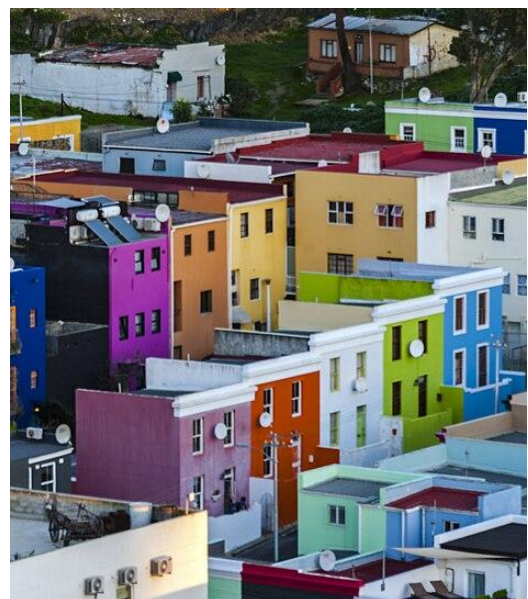
(Bo-Kaap from roof of Strand South hotel, Cape Town, 2018.)