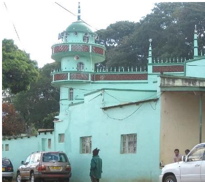
(Mosque in Zomba, Malawi, 2009.)