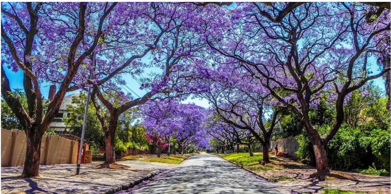
(Pan Street Pretoria HDR,)